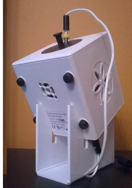
Fig.1. Bio-Well on the calibration stand.