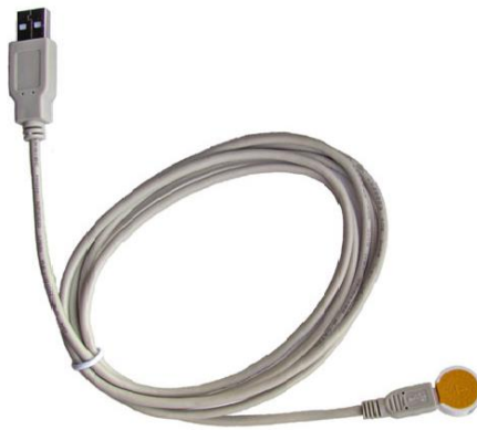
Fig.3. Water Electrode with External Inductor